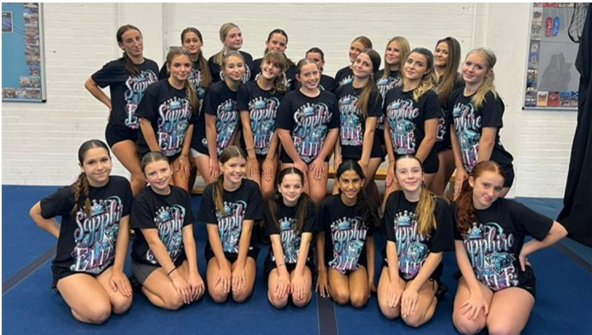
Russell Bedford International Sponsors Cheerleading Squad in UCA All Star National Championship 2026.

As part of taking you further day 2025, Russell Bedford International is pleased to announce its support for local UK cheerleading club Sapphire Elite's 'Spellbound' Cheer Squad as they prepare to compete at the UCA All Star National Championship in Florida, USA in March 2026.